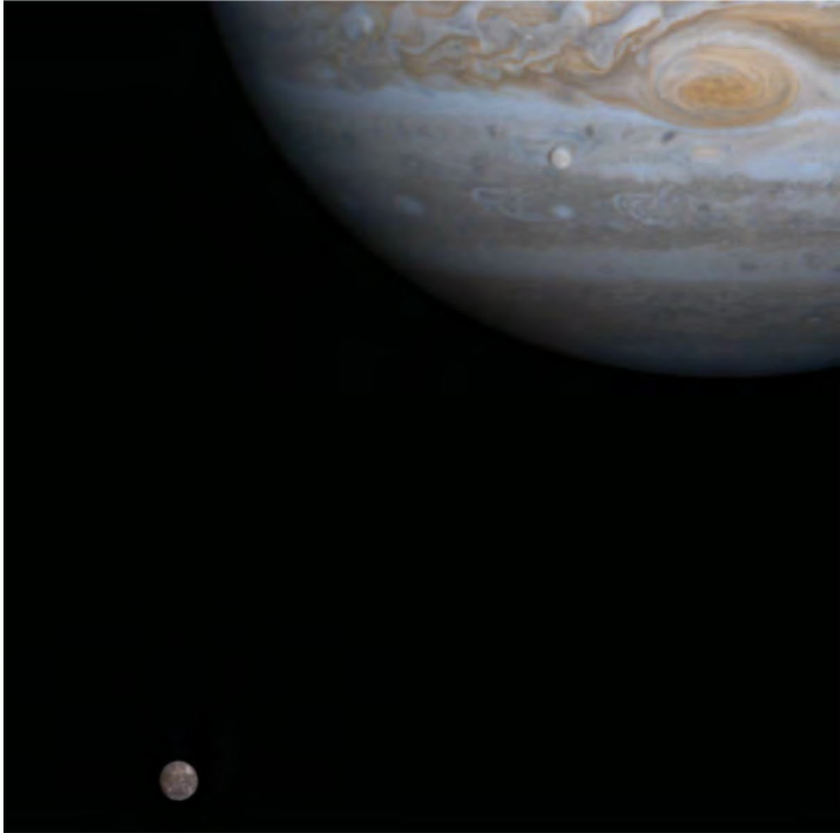
Jupiter and its moons Europa (seen against Jupiter) and Callisto (lower left) as seen by the Cassini spacecraft in 2000.

Workshop themes: This is a practical small, but intense, workshop. We will work around the notions of space and place, through exploration of movement and guided visualizations. The focus is on imagination, the imaginative self and ambiguous boundaries. My way of conducting will draw from experiential anatomy to ideokinesis, to guided daydreaming, to eastern visualization techniques.